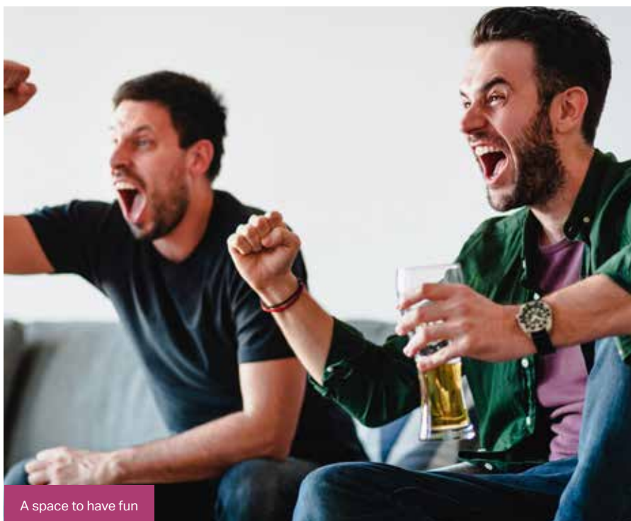
A space to have fun

Appreciate the beauty of the outdoors and have fun in the warmth of an Ultraframe Garden Room.