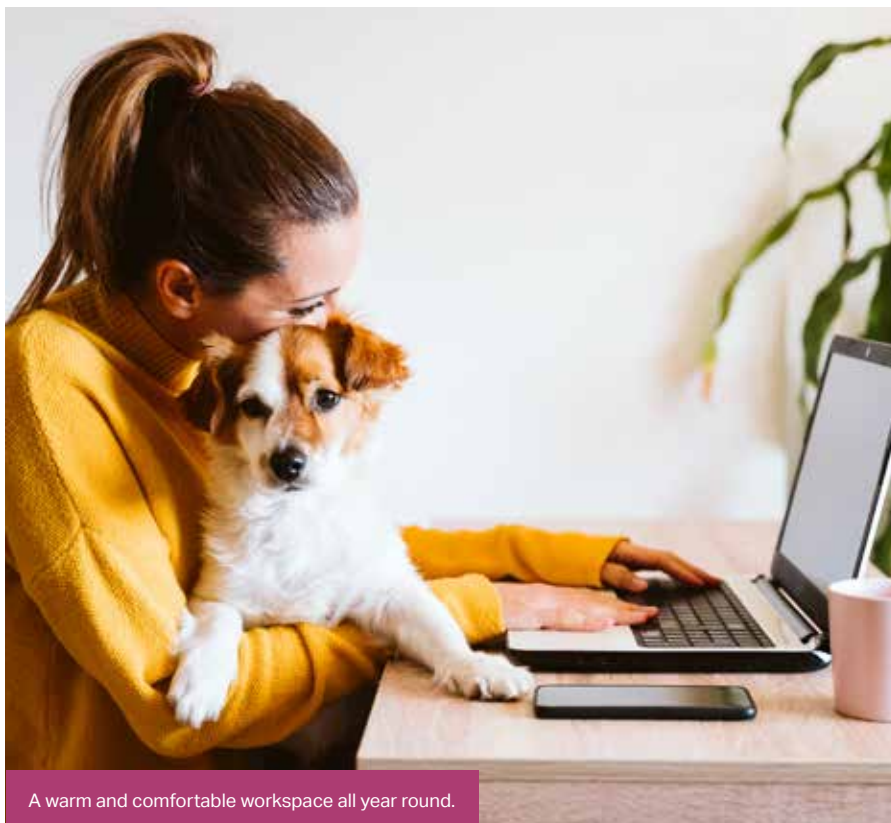
A warm and comfortable workspace all year round.

Providing a warm and comfortable workspace all year round, they are also very efficient to run. Our range of floorplans give you plenty of options for break-out areas and co-working.