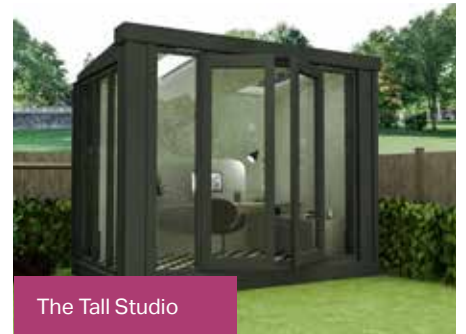
The Tall Studio

With extra height The Tall Studio at 2900mm high is ideal for a variety of activities, and perfect for home gym equipment.