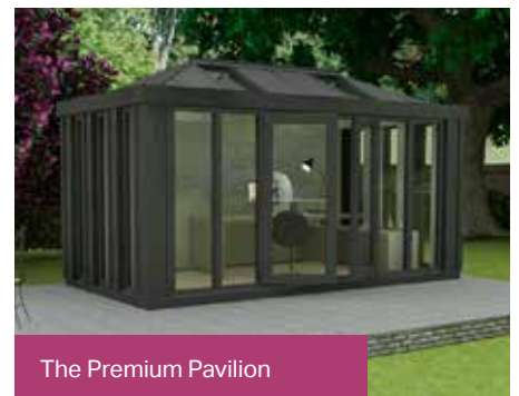
The Premium Pavilion

The inline columns, available exclusively on The Premium Pavilion, not only make a style statement but enable you to have 3 glazed walls which deliver a high thermal performance and bring in even more natural light.