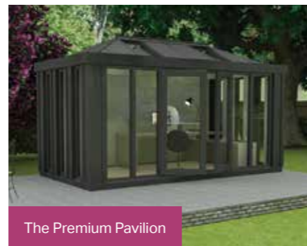
The Premium Pavilion

This grand design adds a luxurious finish to your garden, with its high roof, extensive glazing choices and high thermal performance perfect for a superior garden retreat.