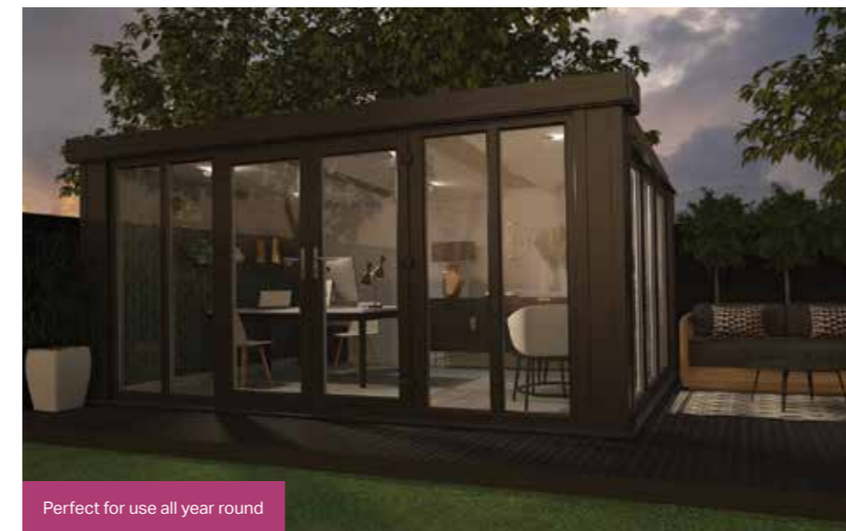
Perfect for use all year round