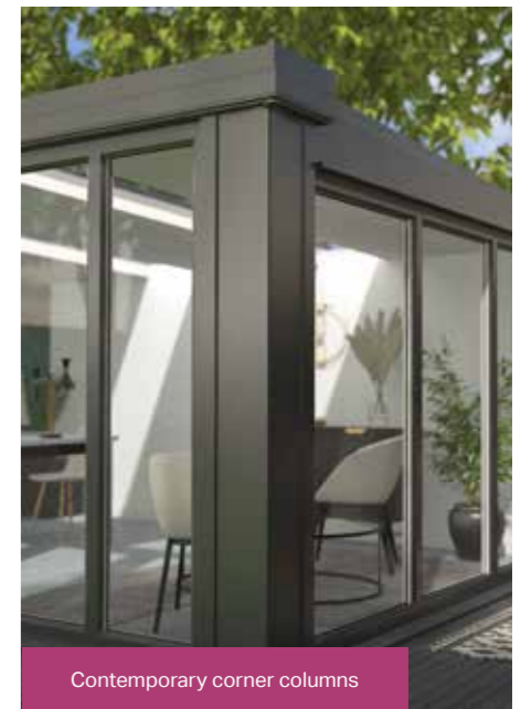
Contemporary corner columns