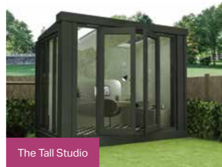
The Tall Studio

Perfect for the corner of a garden, the Studio's design maximises space within planning permission regulations- ideal for a home office or a small outdoor living space.