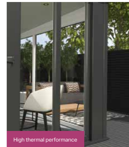
High thermal performance