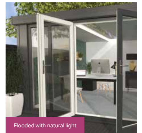
Flooded with natural light