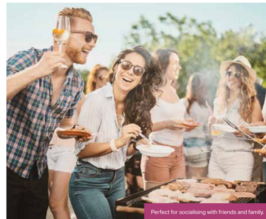
Perfect for socialising with friends and family.

Design your ideal BBQ area, foliage clad garden bar or outdoor firepit to socialise with friends. Whatever your dream space, you can make it happen with a Garden Room from Ultraframe.