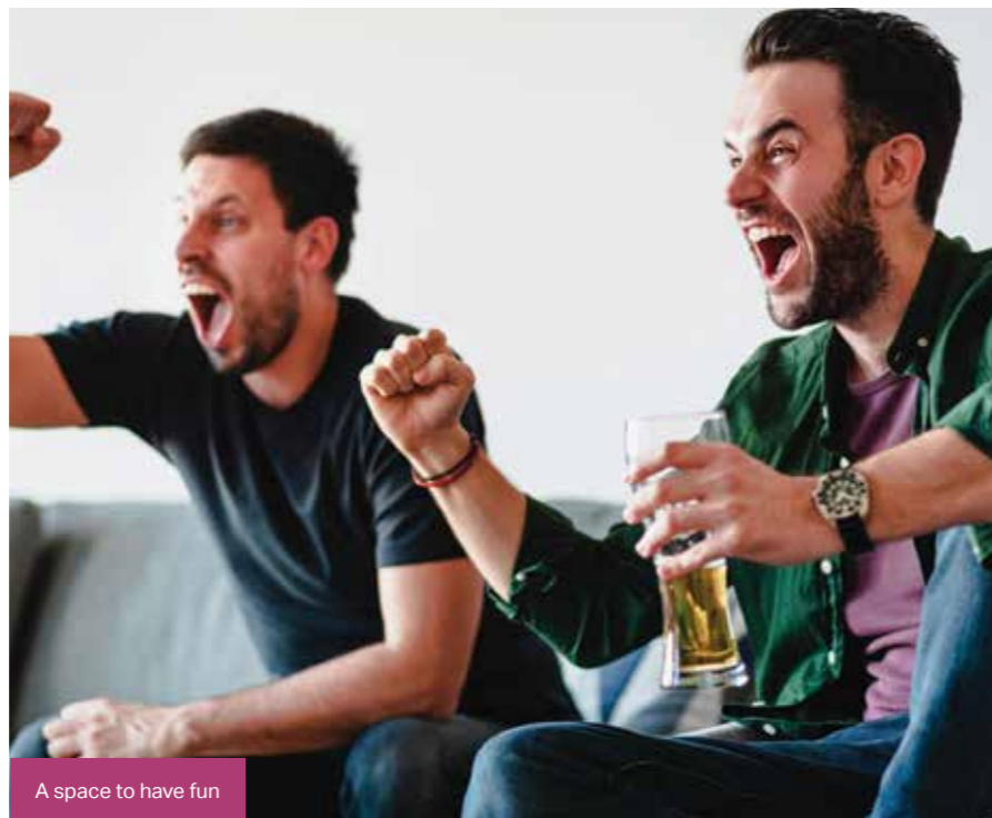
A space to have fun

Appreciate the beauty of the outdoors and have fun in the warmth of an Ultraframe Garden Room.